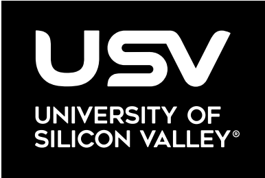
(for dark color backgrounds)