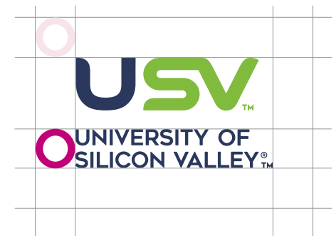
Color Logo Stacked

Clear space is an area where other elements must not encroach into. In order to allow the logo to breathe, we use clear space as a buffer.