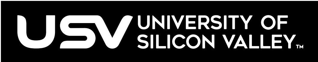
(for dark color backgrounds)