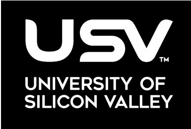
(for dark color backgrounds)