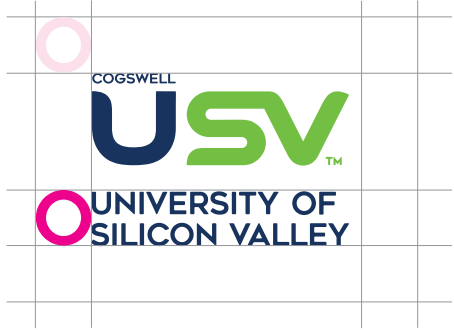
Color Logo Stacked

Clear space is an area where other elements must not encroach into. In order to allow the logo to breathe, we use clear space as a buffer.